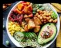
Salads & Sides